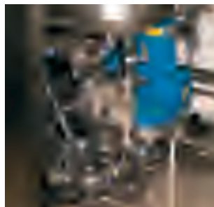
WATER RECYCLING LOOP WITH PRESSURE AND CONDUCTIVITY CONTROL