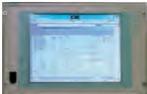
OP OR PC BRANDS: SIEMENS, ALLEN-BRADLEY, HAKKO SCADA SYSTEM DESIGNED FOR FDA 21 CFR PART 11