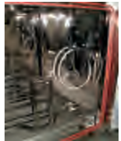
INTERNAL FINISHING OF WASHING CHAMBERS