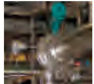
AIR HANDLING GROUP WITH TEMPERATURE CONTROL BY RTD