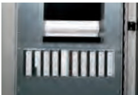
PLC BRANDS: SIEMENS, ALLEN-BRADLEY, MODICON, MITSUBISHI

N.B.: A full description of the control system is contained in the relative booklet.