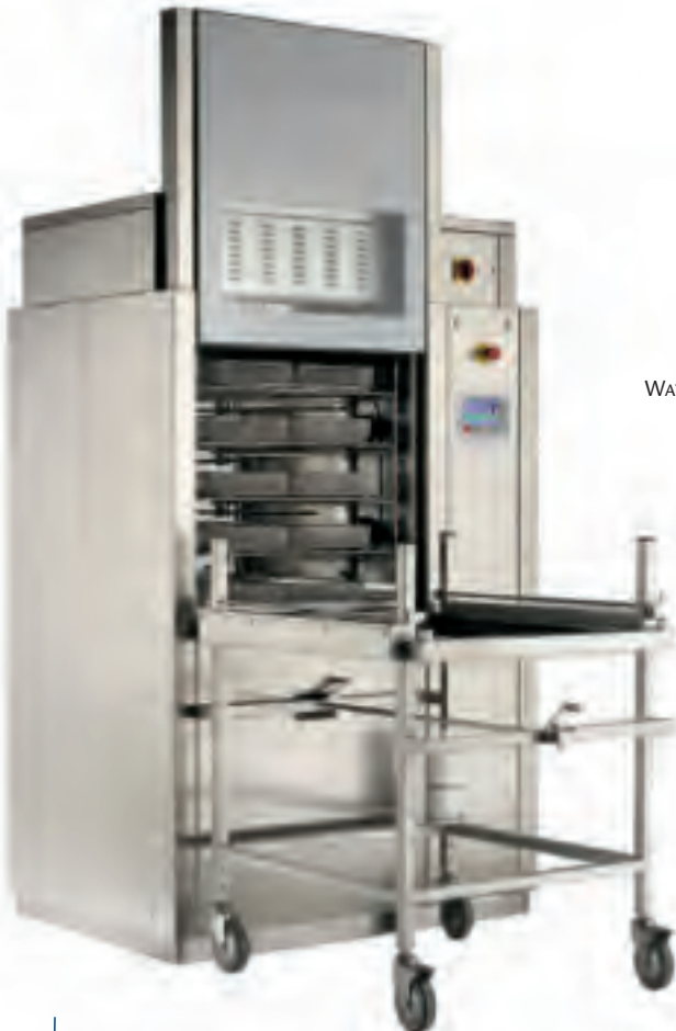
LOADING SIDE OF WASHER TYPE ML 100 N-E